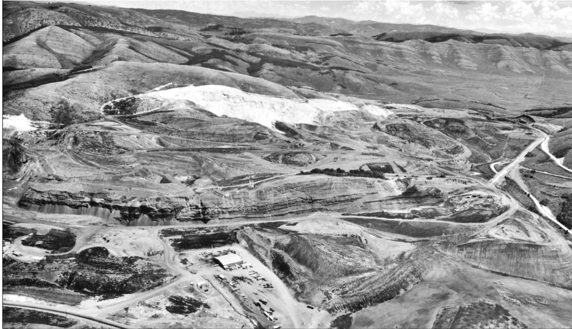
Figure 93. Ballard Mine, 1975.