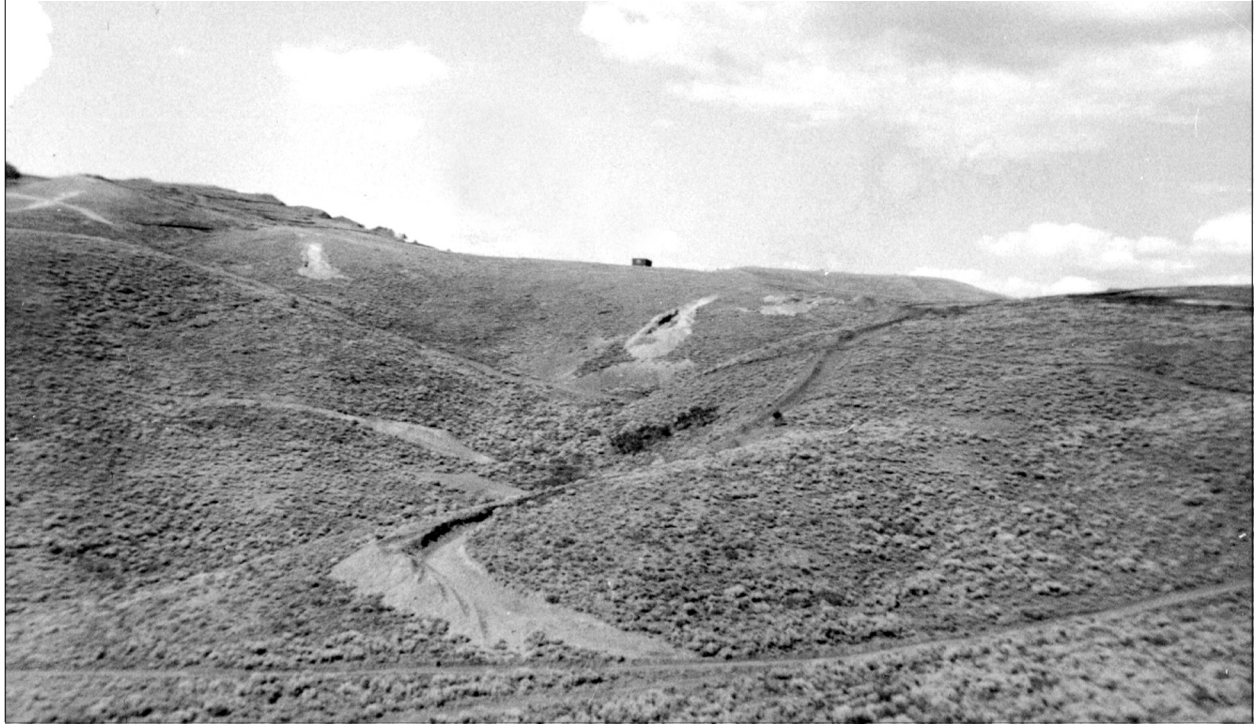
Figure 92. Ballard Mine, July 16, 1951.

The phosphate rock occurs at two horizons and is separated by 100 feet of waste rock. Stripping operations started in June, 1951 on Lease BL-055875 in what was known as the Ballard Pit (Service (1966) refers to the site as the South Ballard Pit). Actual mining in the Ballard Pit started when the weather permitted early in 1952. Mining was done with power shovels and scrapers. Since all of the ore grades were earmarked for the elemental phosphorous plant at Soda Springs, careful ore control was not as critical as at some other mines, however a lower limit of ore grade was carefully determined. Mining operations continued out of the Ballard Pit into the area known as the North Ballard area.