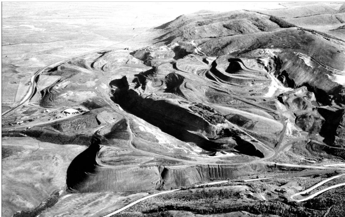
Figure 94. Ballard Mine, August 12, 1975.