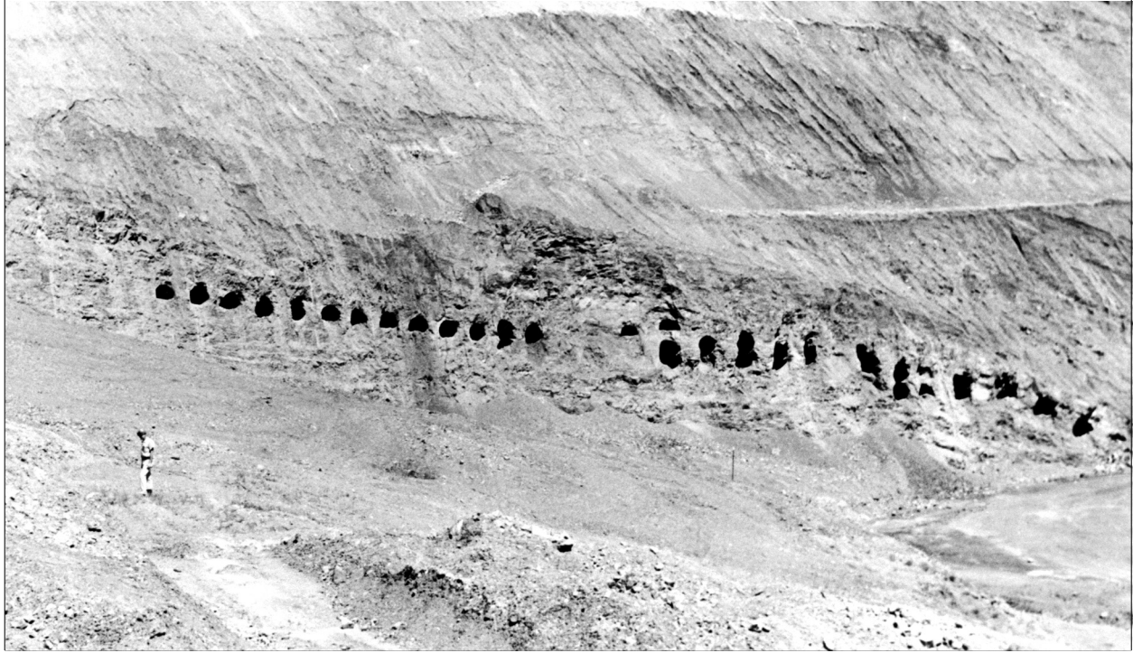
Figure 96. Ballard Mine, north pit of West Ballard, view east, showing 45-inch auger holes, spring, 1966.

In 1970, the Monsanto Company completed active mining at the Ballard Mine. During the 18 years of production, about 11 million tons of phosphate rock was mined and removed from about 191 acres at the Ballard Mine on the two Federal leases. Over 20 million cubic yards of waste rock were stripped; of this amount 2 millions cubic yards were used to backfill the pits with the remaining 18 million cubic yards hauled to the dumps. About 317 acres of land were covered by the dumps and an additional 96 acres were used as service areas for the mine (USGS, 1977).