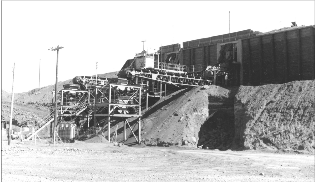
Figure 95. West Ballard Mine tipple, July 10, 1962.

According to Service (1966), the loading facilities included tipples, screens, conveyors, weigh bins, and automatic samplers (Figure 95). In 1962, Monsanto contracted with Wells Cargo to be the mine operator while Morrison Knudsen Company retained the contract to haul the ore to the processing plant. Also in 1962, the conveyor belt was removed from the West Ballard Pit because of the advance of mining made it unusable.